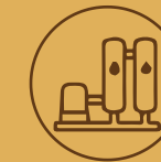
Alkaline RO water purifier