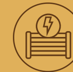
Solar fencing for compound wall