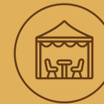
Gazebo at stilt level

3 BHK Luxurious Apartments in 206.5 Ankanams of site with UDS of 10.625 & 10.024 Ankanams