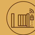
Automated motorized gates with security operated