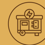
Full Power backup for each flat