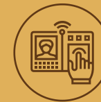
Digital smart lock for main doors with biometric pass code & key