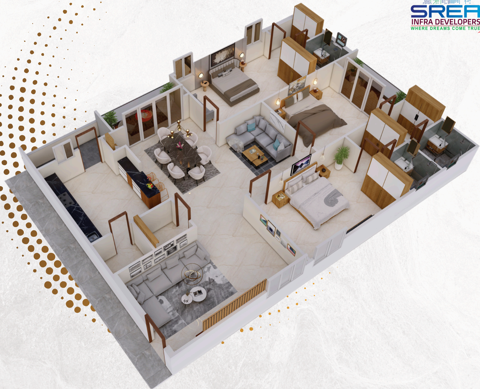
01 Type : 3 BHK Facing : East Area : 2500 sft