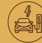
EV charging point for one car