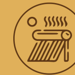
24 X 7 hot water facility for master bathroom with heat pump or solar water heater