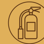
Fire extinguishers at common area, corridor & panel boards