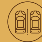
Double car parking for each flat