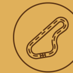
Walking track with combination of gravel & pebbles at stilt level