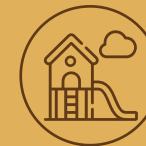
Kids play area with green space & sit out