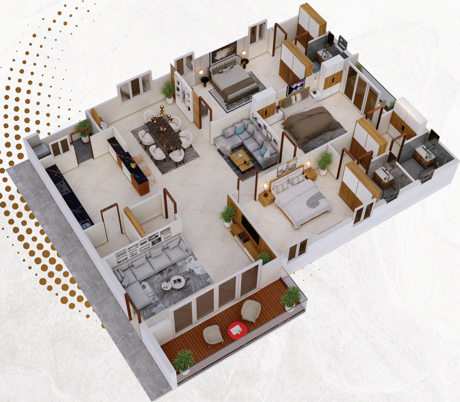
02 Type : 3 BHK Facing : East Area : 2650 sft