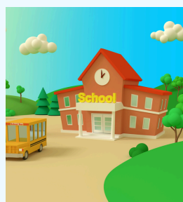
Geetha Public school